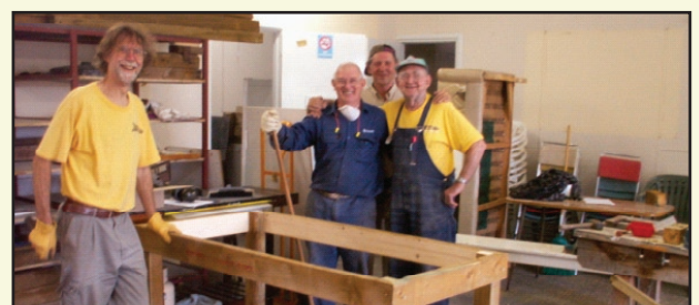
Men play, talk and support each other in the Fremanshed Inc.