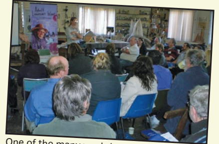
One of the many workshops at The Fremanshed Inc.