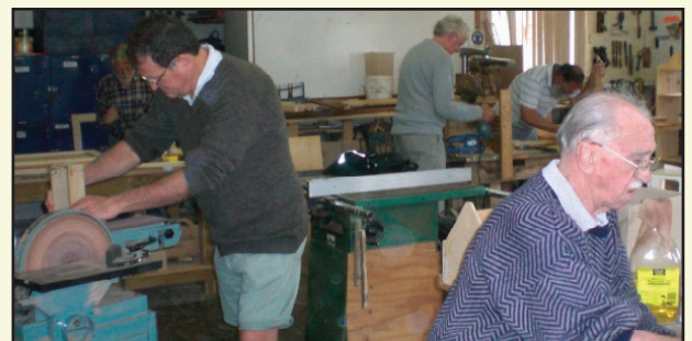
Men at work